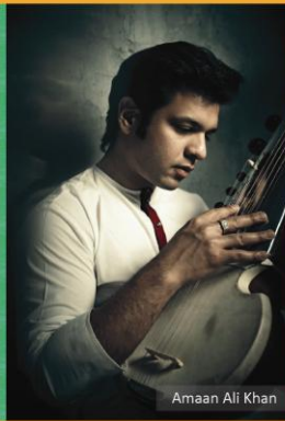
Amaan Ali Khan

Beginners, students and music practitioners are all welcome