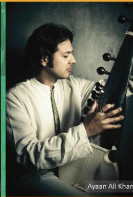
Ayaan Ali Khan